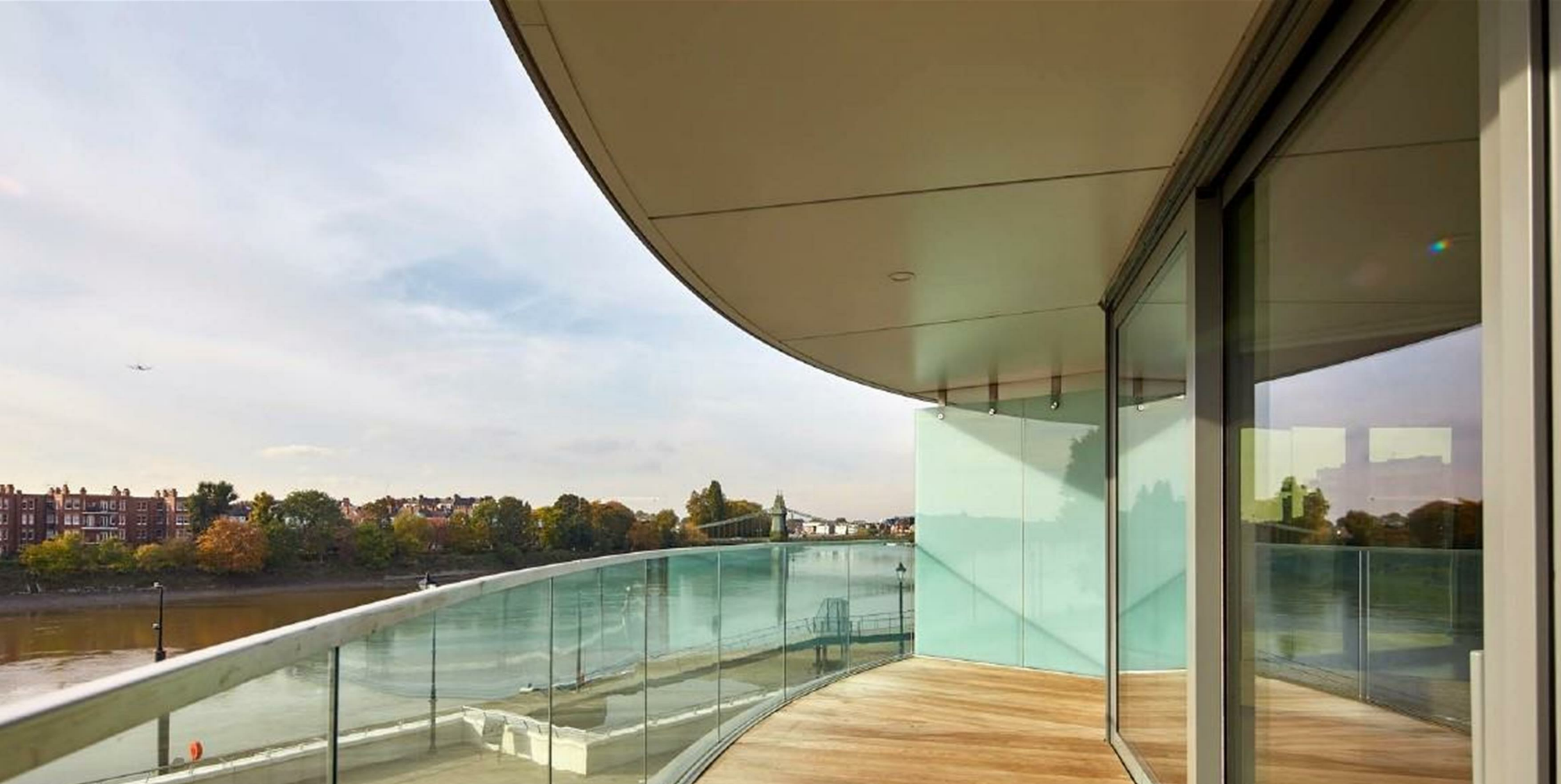
Goldhurst House, Hammersmith W6